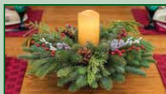
CIANA CENTERPIECE (4 per case)