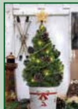
22" TABLE TOP CHRISTMAS TREE (6 per case)