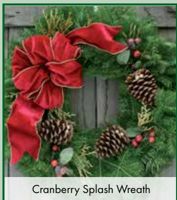
Cranberry Splash Wreath