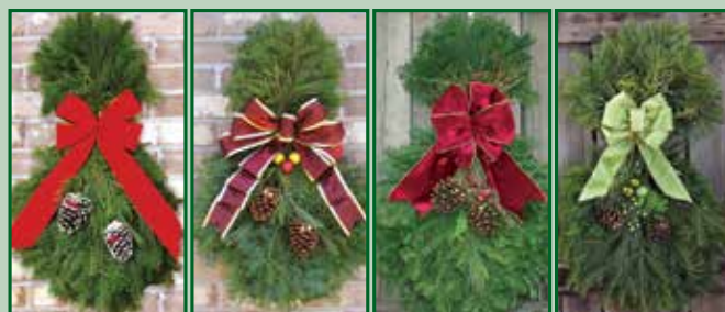
Classic $17.00 each Victorian $19.50 each Cranberry Splash $20.75 each Wintergreen $20.75 each