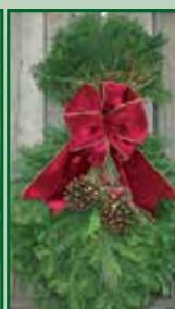
Cranberry Splash $19.75 each