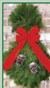
Classic $16.00 each