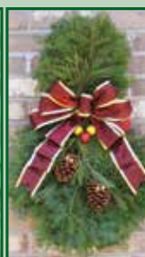
Victorian $18.50 each