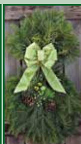
Wintergreen $19.75 each