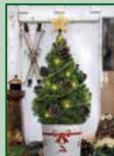
22" TABLE TOP CHRISTMAS TREE (6 per case)